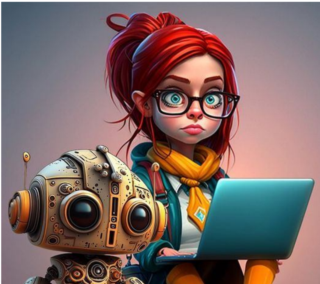
AI Generated Woman

That will be at 7 PM on Thursday May 18 th !